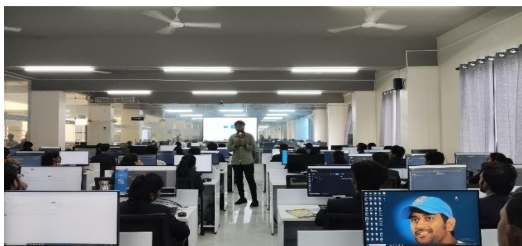
16-10-2024, 9:20 AM – 12:40 PM (IT: Room No.7112)