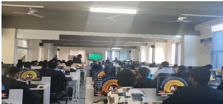
16-10-2024, 1:20 PM – 4:40 PM (CSE: Room No. 7311)