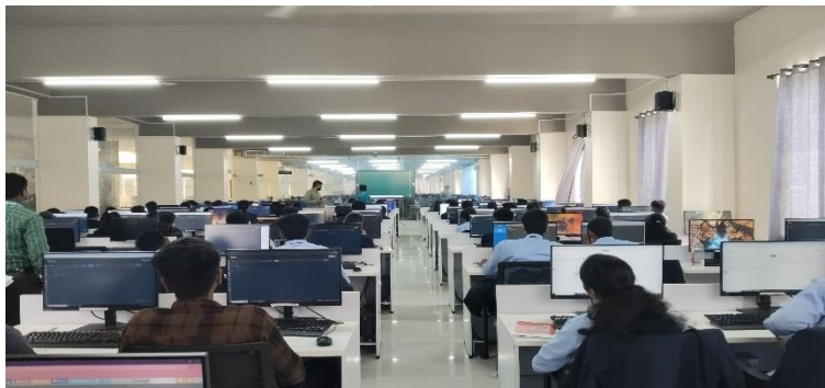
16-10-2024, 1:20 PM – 4:40 PM (ECE, CSE and CSE(AI&ML)): Room No. 7112)