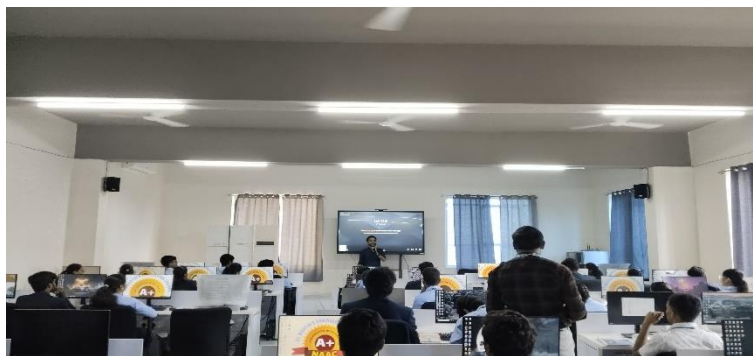
16-10-2024, 9:20 AM – 12:40 PM (AI&ML and CSD: Room No.7311)